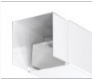
Joiner band and support bracket for continuous runs